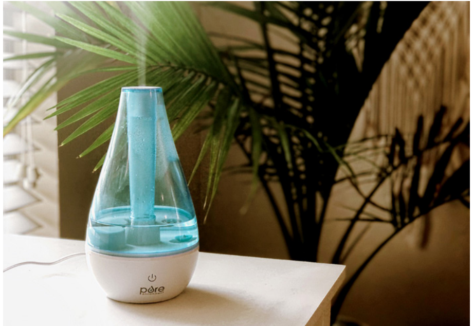
Adding humidity inside your home can make the air feel a little warmer.

Use a portable space heater in the room you use most often so you can turn the thermostat down a bit and avoid heating unused spaces.