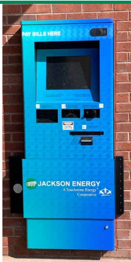
Jackson Energy's new drive-thru payment kiosk, installed at the London District Office, offers an additional, convenient way for members to pay.

Kiosks are located at Rite Kwik Market in Burning Springs, Town & Country in Annville, Peg's Food Mart in Mt. Vernon, Quickie Market in Manchester, Jack's IGA in Beattyville, Fill-Ups Gas & Grocery in Clover Bottom, E.C. Porter's IGA in London and now at Jackson Energy's London District Office.