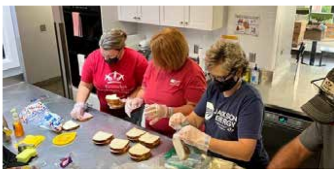
Employees from Kentucky's Touchstone Energy Cooperatives deliver donations and help with lunch for the guests at the Ronald McDonald House in Lexington.